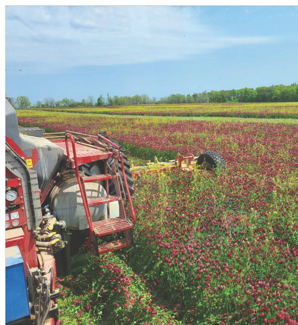
Photo 1. Planting into established cover crop mix

With a 16-row planter, he planted into a dense stand of overwintered cover crop mix that included crimson clover, hairy vetch, Vivant turnips and some overwintered Austrian winter peas, and used GPS-guided machinery to define and maintain the strips.