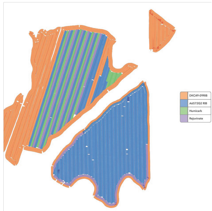
Figure 1. Map of Larry's planting. Blue: standard treatment. Green: 30% reduction in N with alternative fertilizers. Purple 50% reduction in N rate with alternative fertilizers.