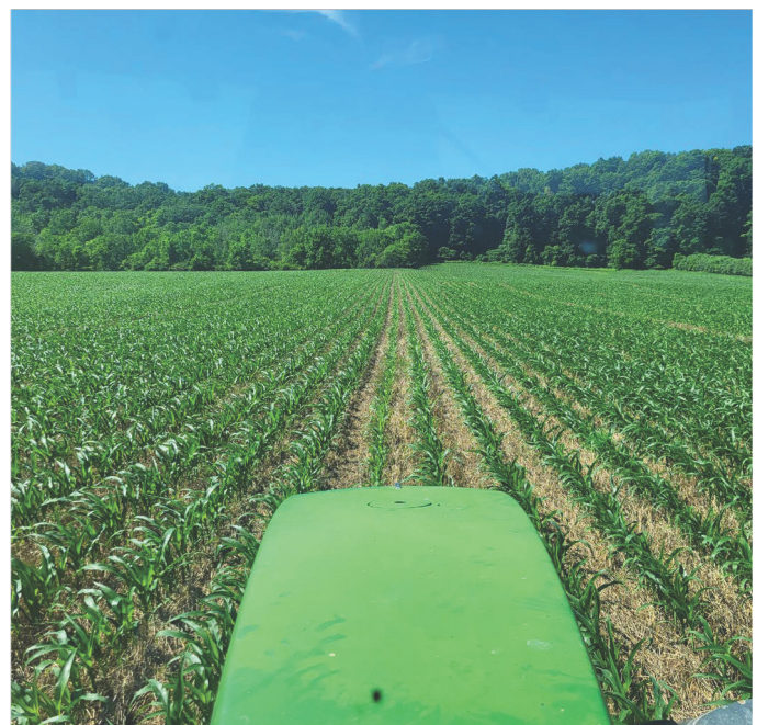
Photo 2. Field corn at side-dressing time.