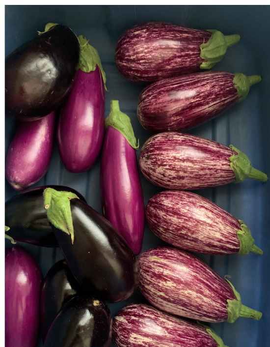
Eggplant trial varieties harvested at Everdale.