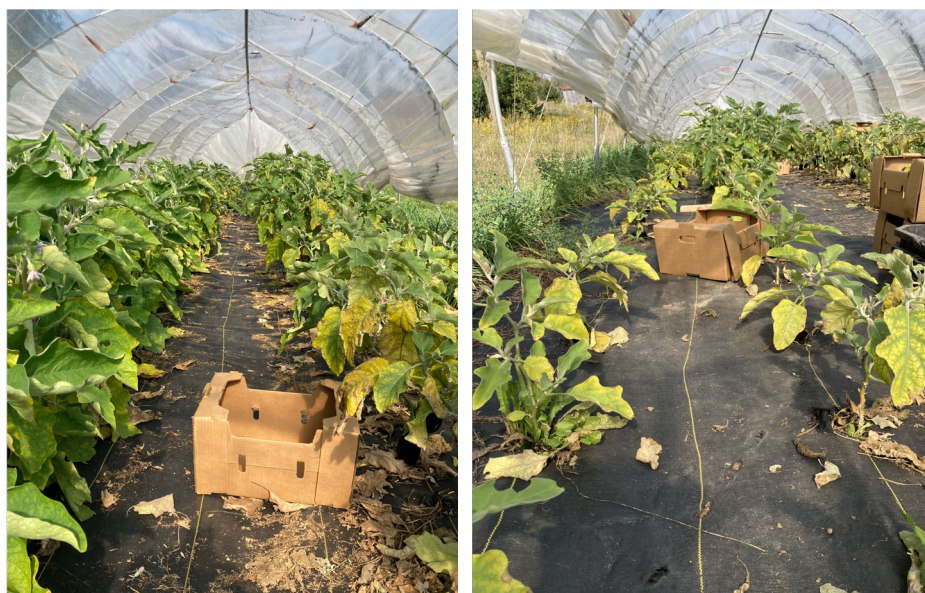
Eggplant plots with stunted rows in the northern beds (right)

“CONTEMPLATING EGGPLANTS FOR SO LONG WAS AN ABSOLUTE PLEASURE. OUR BABA GANOUSH HAS BEEN PERFECTED.”