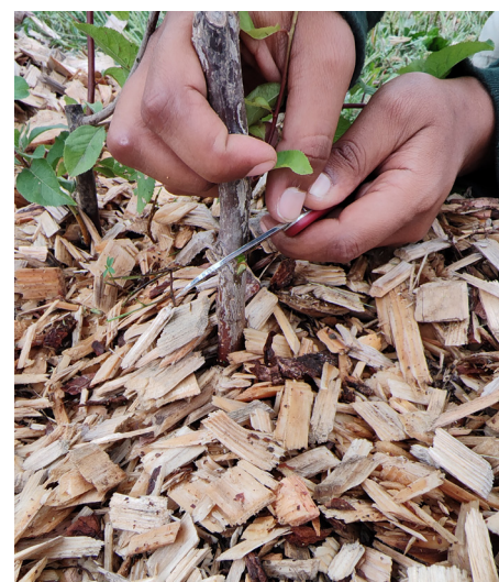
Photo 1. Preparation for a graft