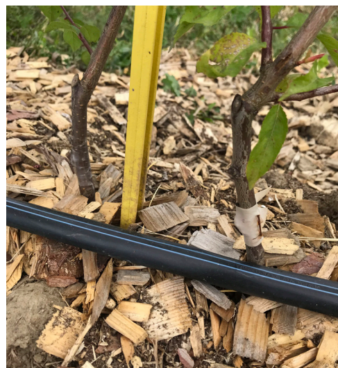
Photo 4. Grafting methods side-by-side