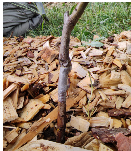
Photo 2. Grafting with Buddy Tape