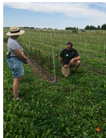
Photo 7. Sharing trial experimental design during the field day in 2024