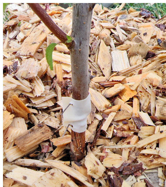
Photo 3. Grafting with Speed Easy Bud Ties

Buddy Tape resulted in two times the number of trees dug in fall 2025 as seen in Figure 2 . There’s very high statistical confidence that Buddy Tape performed better, with only a 0.005% ( P = 0.005 ) chance the better performance was due to