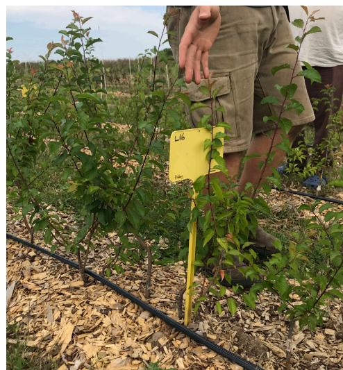
Photo 6. Sharing trial experimental design during the field day in 2024