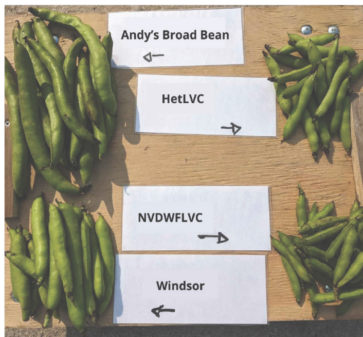
Mature pods of each of the four fava bean varieties grown for the trial.