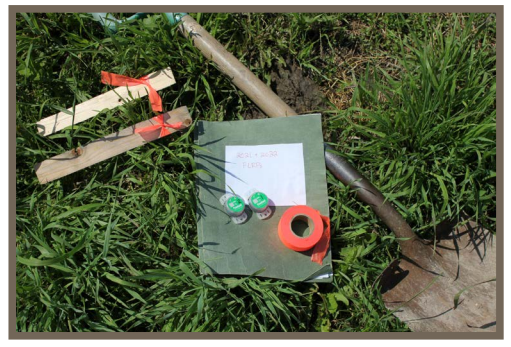
Photo 2 . HOBO Pendant® MX Water Temperature Data Loggers before being buried 5 cm below the soil surface in a tilled control plot and a no-till treatment plot with landscape fabric.