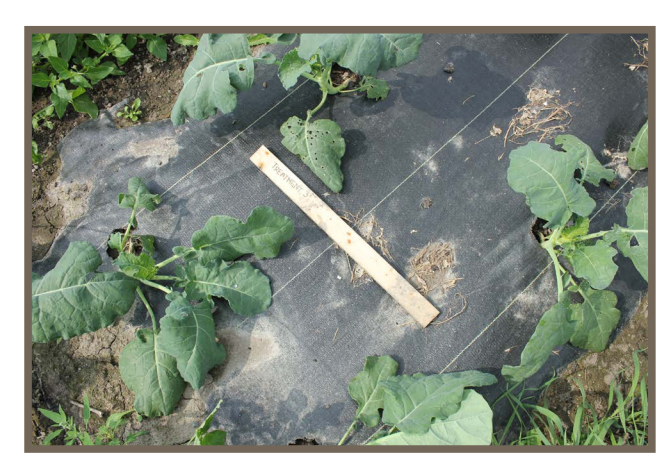
Photo 4. An example of weed pressure in no-till plots with landscape fabric.