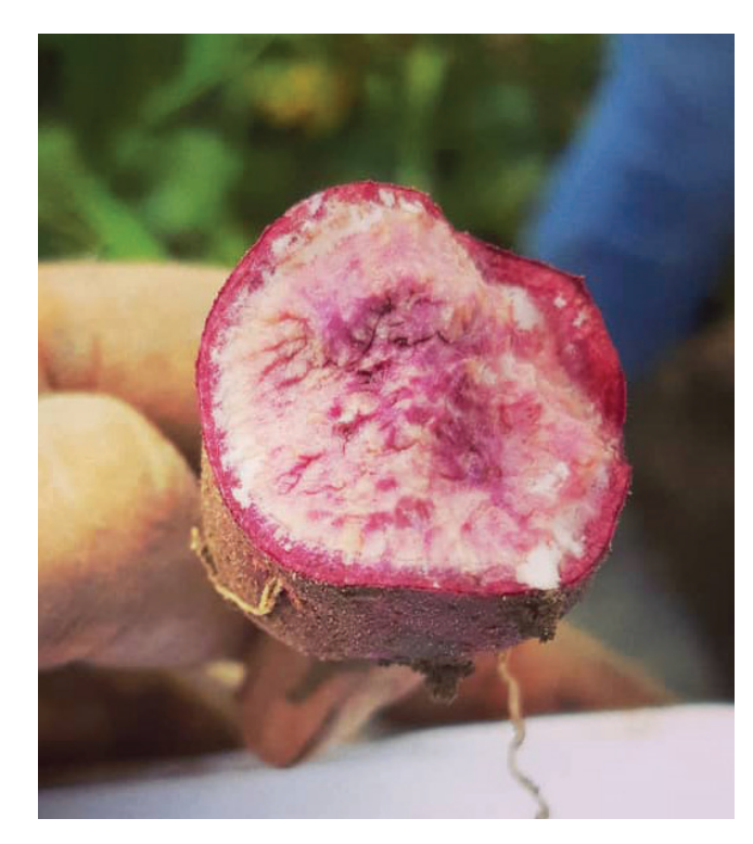
Photos: Slips growing in the greenhouse prior to planting out in the field ( top ). Large white skinned tubers being harvested ( left ). Tuber with light purple and peach flesh ( right ).