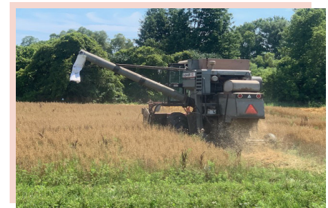
Photo 2. Direct combining an oat plot on July 31, 2020.