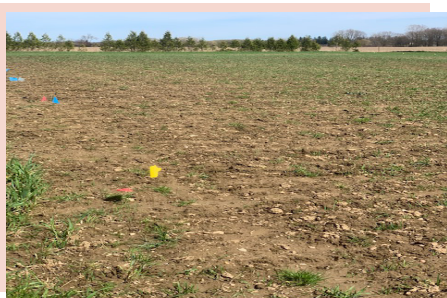
Photo 1. Spotty emergence to the left in plots caused by poorly drained soil. Photo taken May 3, 2020.

In all plots, Ken planted oats into winter-killed daikon on April 4, 2020. Emergence was slow in all plots, and especially in areas of the field with poor drainage ( Photo 1 ). There was no additional management between planting and harvest, which Ken did by direct combining on July 31, 2020.